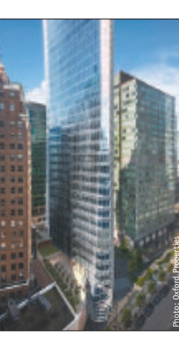
New York-based Kohn Pedersen Fox architects designed the 35-storey MNP tower on West Hastings for Oxford Properties.